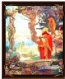
Reasonable – Man