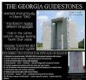
Reasonable – Man