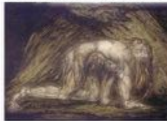
Unreasonable – Animalistic