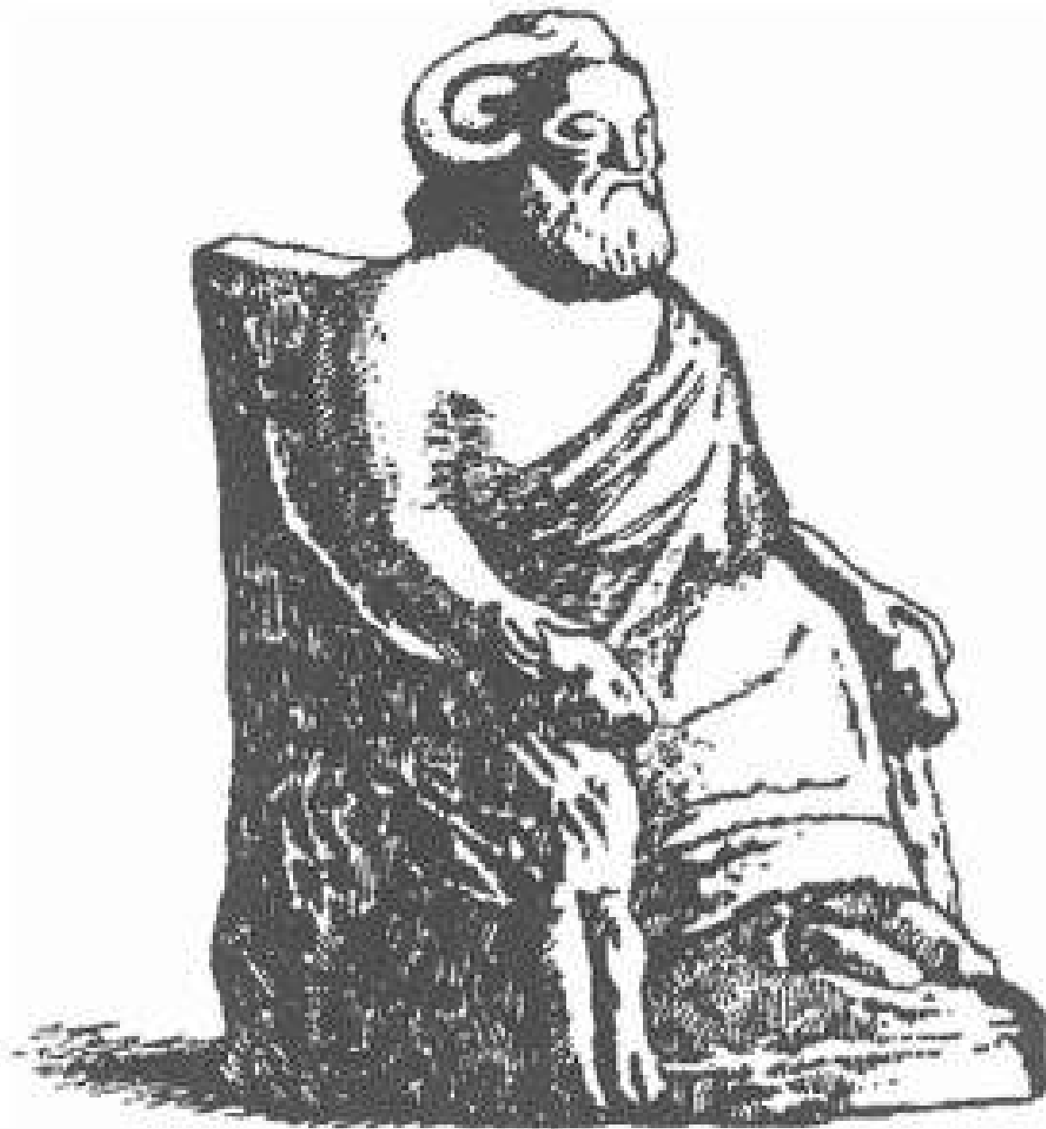
Image of Baal-Hammon