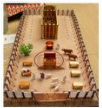
Eastern "Gate' Rising Sun