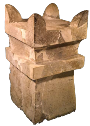
Altar of Incense found at Mediggo

Between the Most Holy Place and the Holy Place there was a curtain. And just in front of that curtain in the Holy Place was an altar of incense. This altar is a small square box, 1 ½ feet long and wide (1 cubit) and 3 feet tall (two cubits). It is made of acacia wood and overlaid in pure gold, like almost everything in there. In this altar the priest would place incense which would then be burnt in a prescribed way. This incense would cover the mercy seat, the place where Christ sat, so that he would be shielded and not die (Lev 16:13). As someone has said, "The cloud of incense screens the High Priest from the Divine Presence."13 So part of the function of the altar of incense is to shield and protect the priest from God's wrath, which he needs because he is sinful. I am not interested in the incense here, but rather, the horns, because this is where he puts the blood.