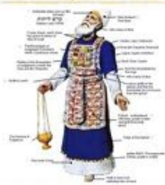
Aaronic High Priest – Israel