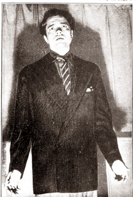
"I Didn't Know". Orson Welles, after broadcast expresses amazement at public reaction. He adapted H. G. Wells' "War of the Worlds" for radio and played principal role. Left: a machine conceived for another H. G. Wells story. Dramatic description of landing of weird "machine from Mars" started last night's panic. —Story on page 2.