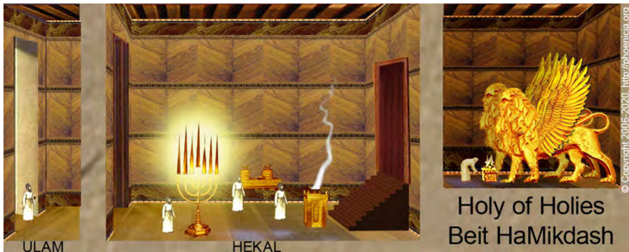
The Temple cut away