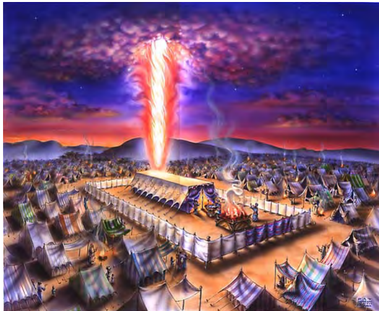
Tabernacle Shekinah Glory – Artist Unknown – from http://raebear.net/faith/biblestudy/exodus/seg3_sinai/finishing_touches.php

a long time and God finally said that his eye shall not spare, neither will I have pity, but I will bring their way upon their head. They are getting what they deserved. Completing this section of scripture is the Lord Jesus (man in linen) returning to God The Father saying, “ I have done as thou hast commanded me. ” He has anointed the righteous Israelites who sigh and that cry over all the abominations that are done in the midst thereof (Ezekiel 9:4b). Now that the righteous are protected and the judgment of the Babylonian invasion is underway the Lord will leave His earthly dwelling place in the Holy of Holies of the Temple which was also in the Tabernacle before the Temple was built.