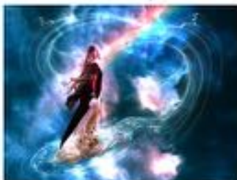
First Fruits Rapture