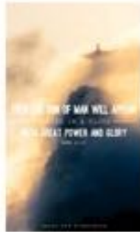
Present: Christ in YOU – Hope of Glory Hope (Faith) is Future: Not Seen (Joh 1:24:21, 8:12:24)