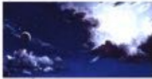
Daniel's Vision of Jesus: Bridging First – Second Creations – Assured Victory