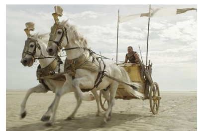
"Harness the chariot to the swift steeds" (1:13)

micah 6:8 "He has told you, 0 man, what is good: and what does the Lord require of you but to do justice, and to love kindness, and to walk humbly with your fod."