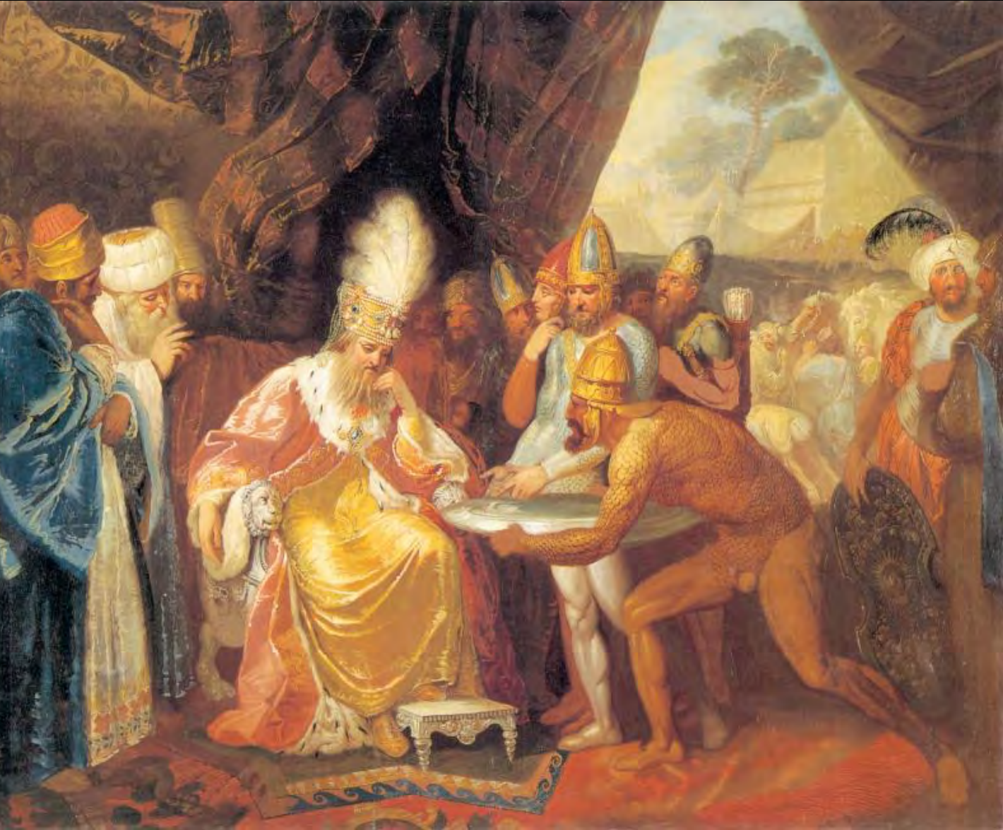
Scythian Emissaries Meeting with Darius by FRANCISZEK SMUGLEWICZ cir. 1785

Book of Ezekiel Message 18 January 3, 2016