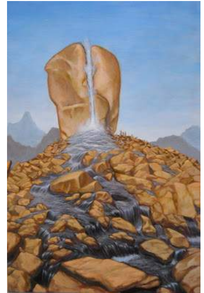
Water flowing from the struck Rock Type of Christ