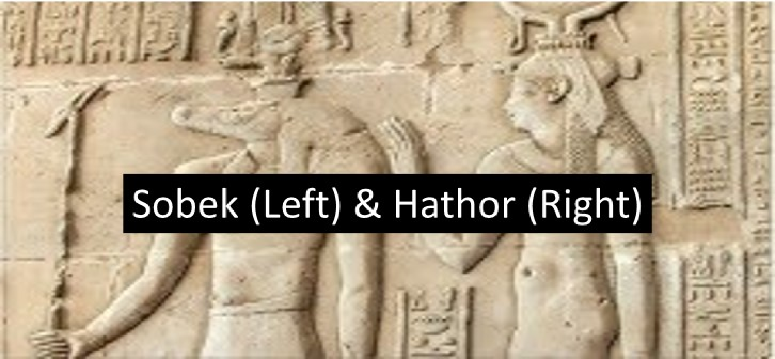
Sobek (Left) & Hathor (Right)