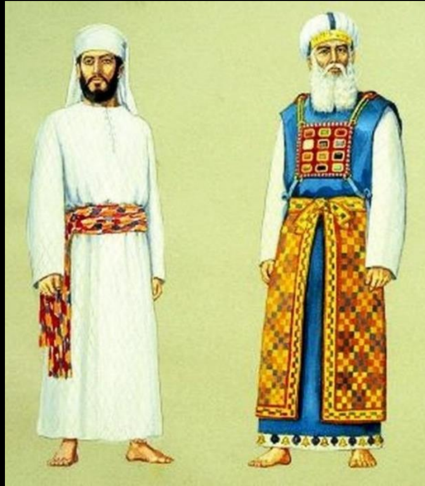
the high priest