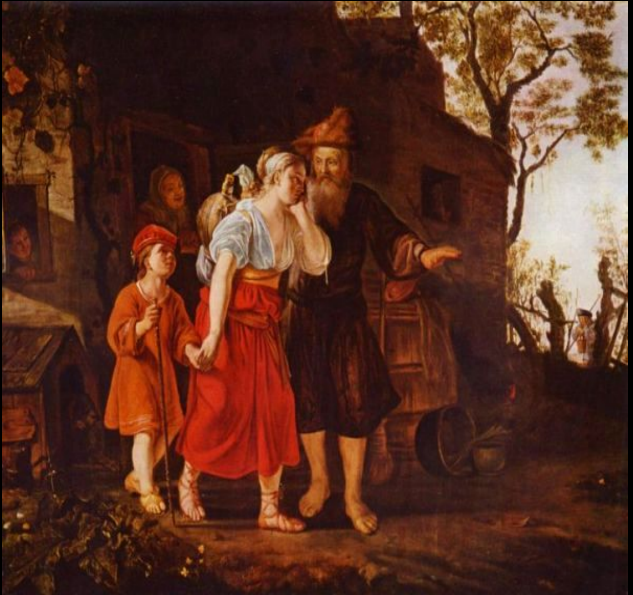
Jan Victors 1635

Isaac is Born & Ishmael is Expelled Genesis Message Forty-Eight Genesis 21: 1-21