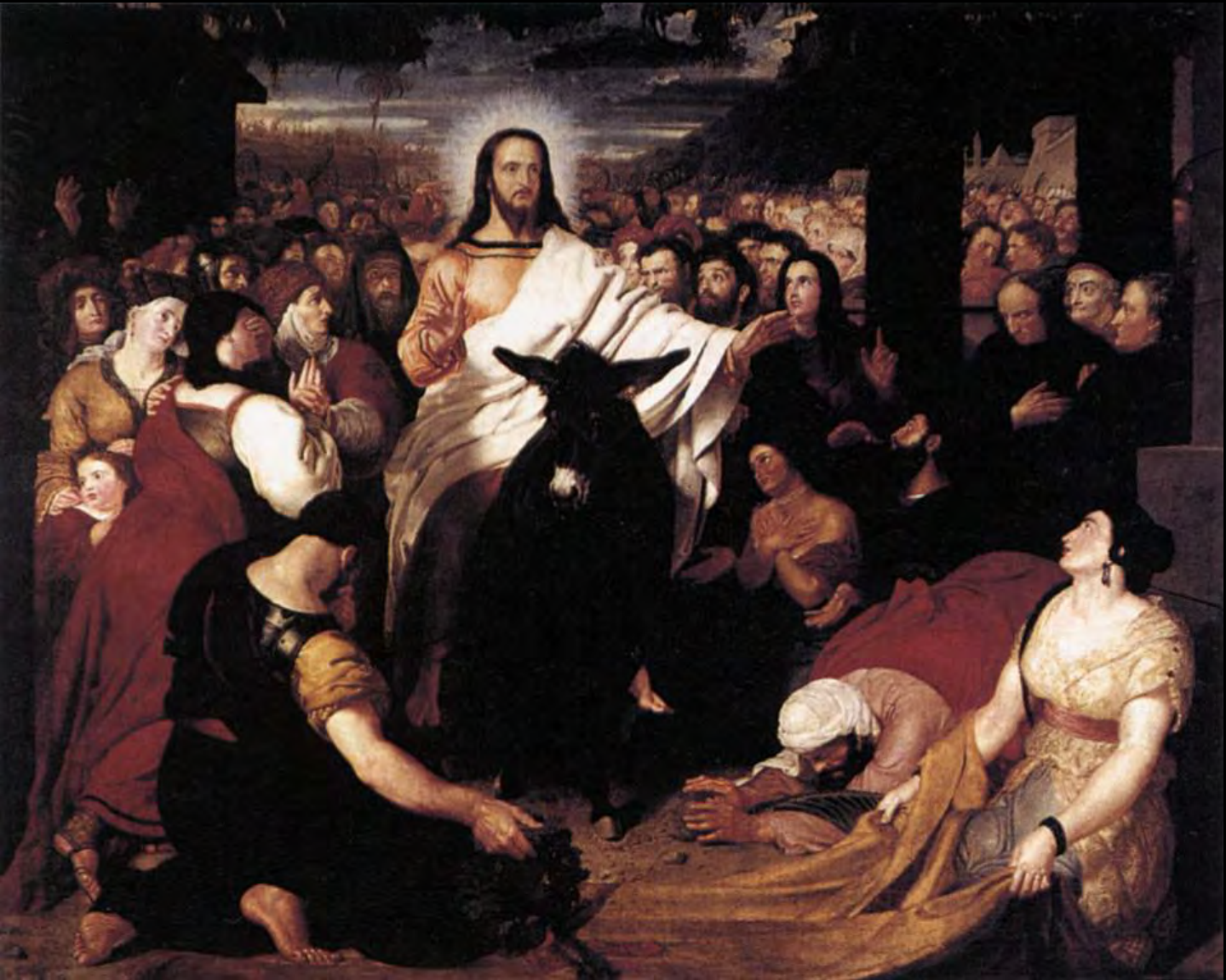
Jesus Enters Jerusalem by Benjamin Robert Haydon Cir 1814-1820