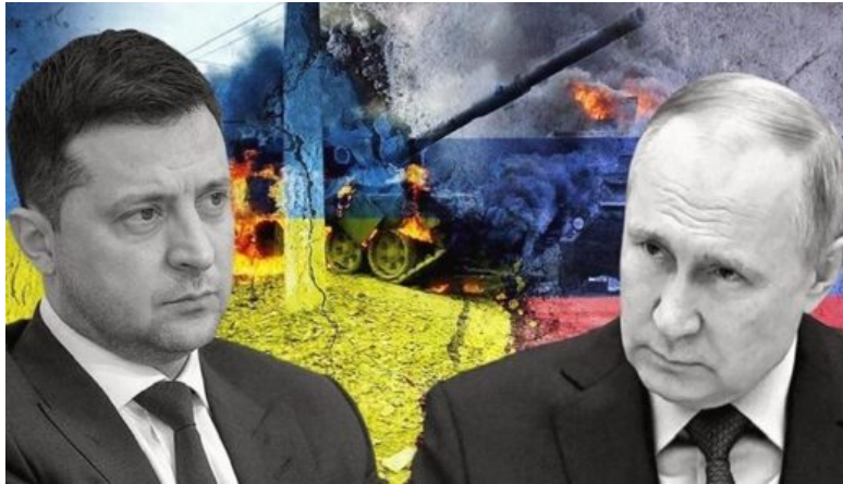
Ukrainian State Leader Vladimir Zelensky and Russia President Vladimir Putin