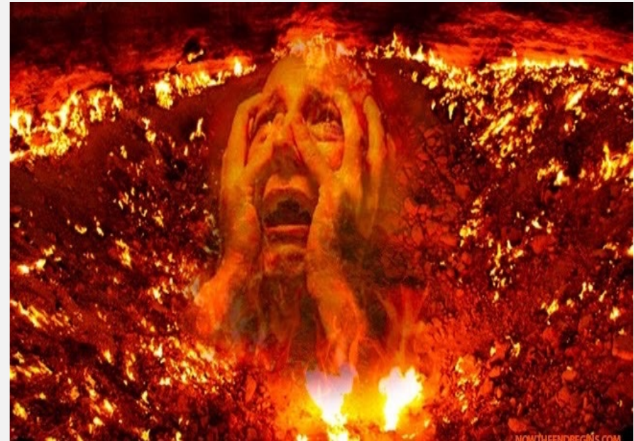
SONS OF SATAN (JN 8:44)