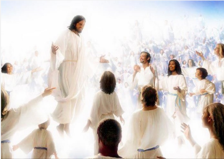
ADOPTED SONS OF GOD (GA 4:1-7)