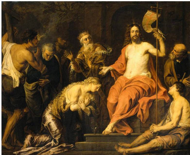
Christ and the Penitent Sinners by Gerard Seghers Cir. 535

WHO DO YOU SAY THAT I AM? THEREFORE WHO WILL BELIEVE?