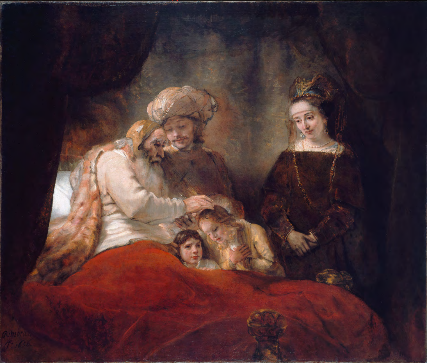
Jacob blessing the Children of Joseph, nu Rembrandt Cir 1656