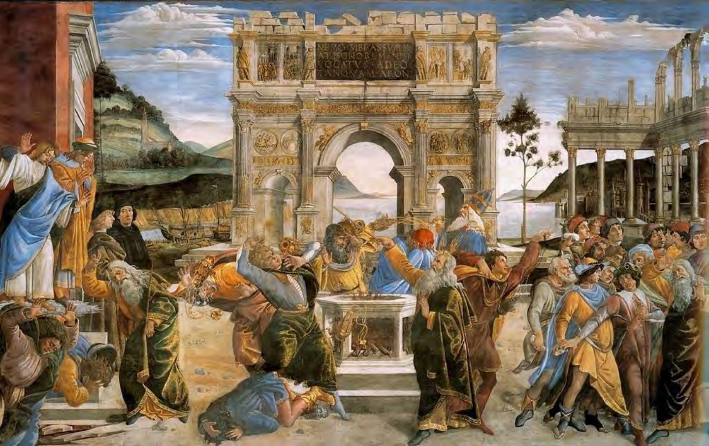
The Punishment of Korah, Dathan and Abiram by Botticelli cir 1482