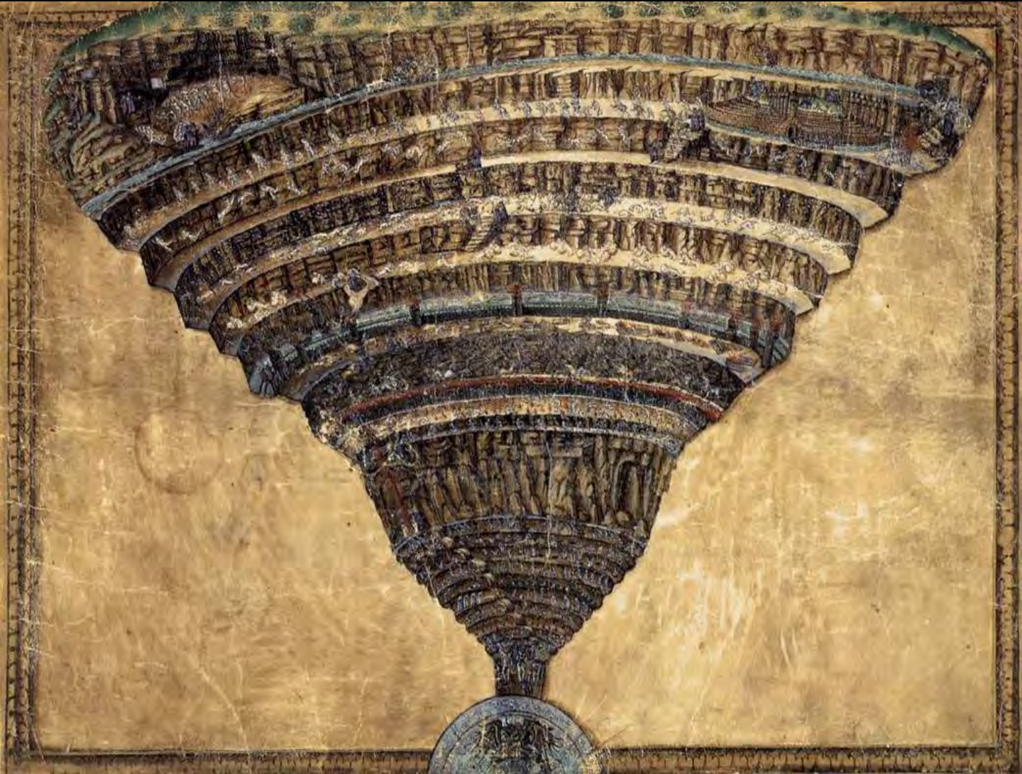
The Abyss of hell by Botticelli cir 1485