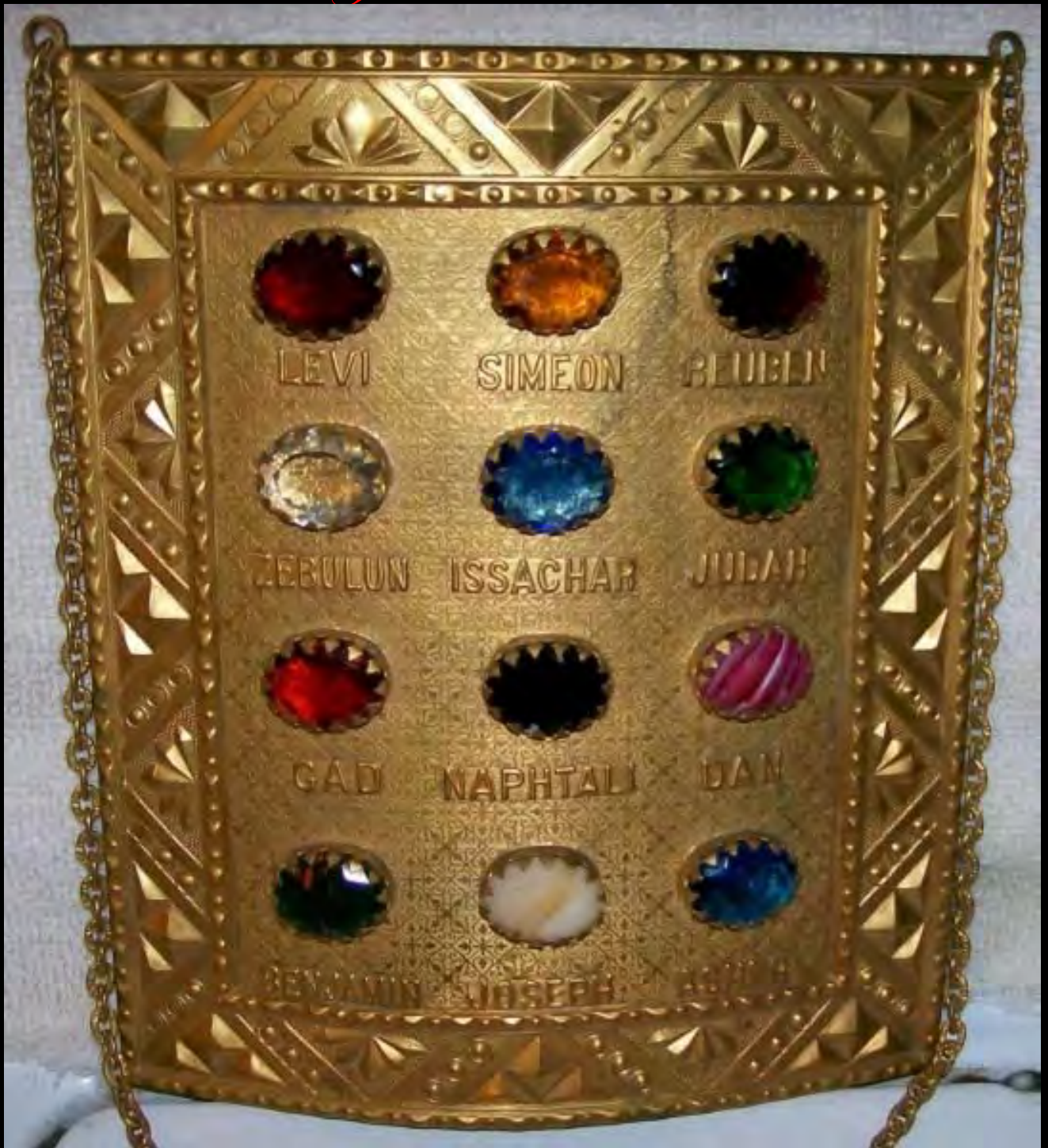
The Breastplate of the High Priest, Artist Unknown