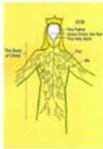
Christ's – Believers