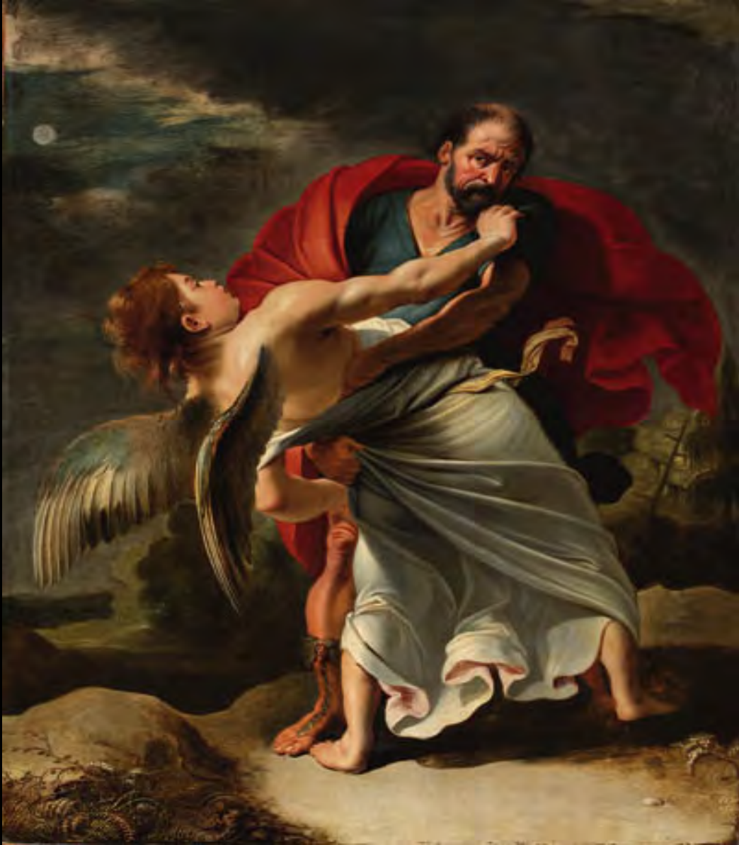
Jacob Wrestles with The Angel by Rubens 1624

Jacob Becomes Israel & Meets Esau Genesis Message Sixty-Seven Genesis 32: 22 - 33: 20