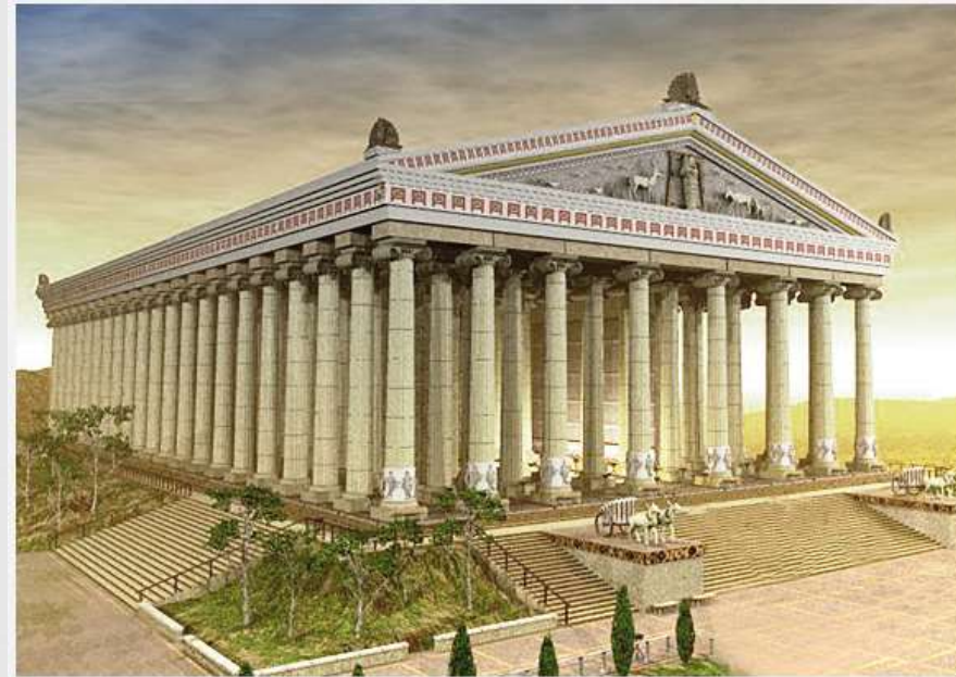
Temple of Artemis - Ephesus (as it used to be during ancestry)