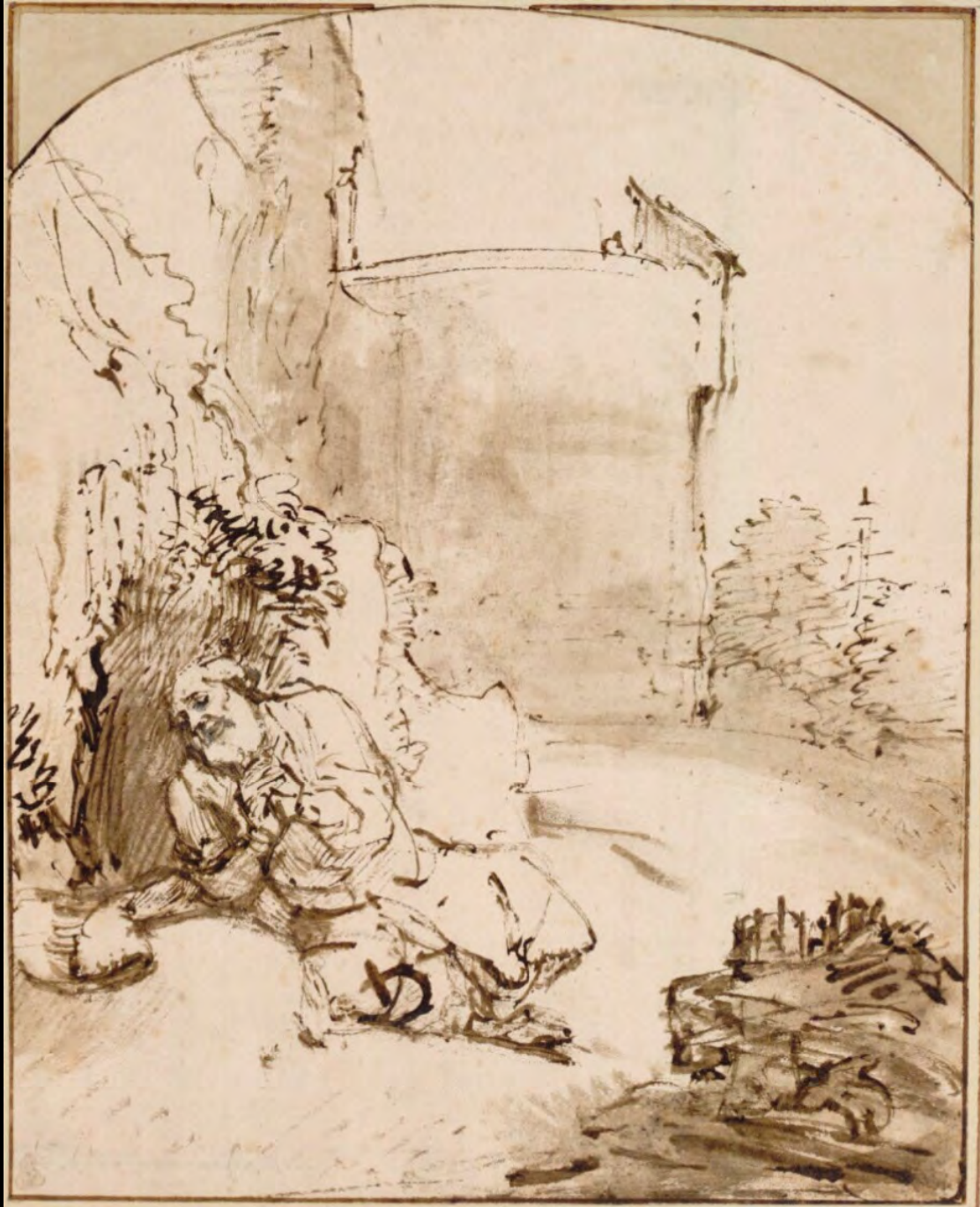
Jonah Praying before the Walls of Nineveh by Rembrandt Cir 1665