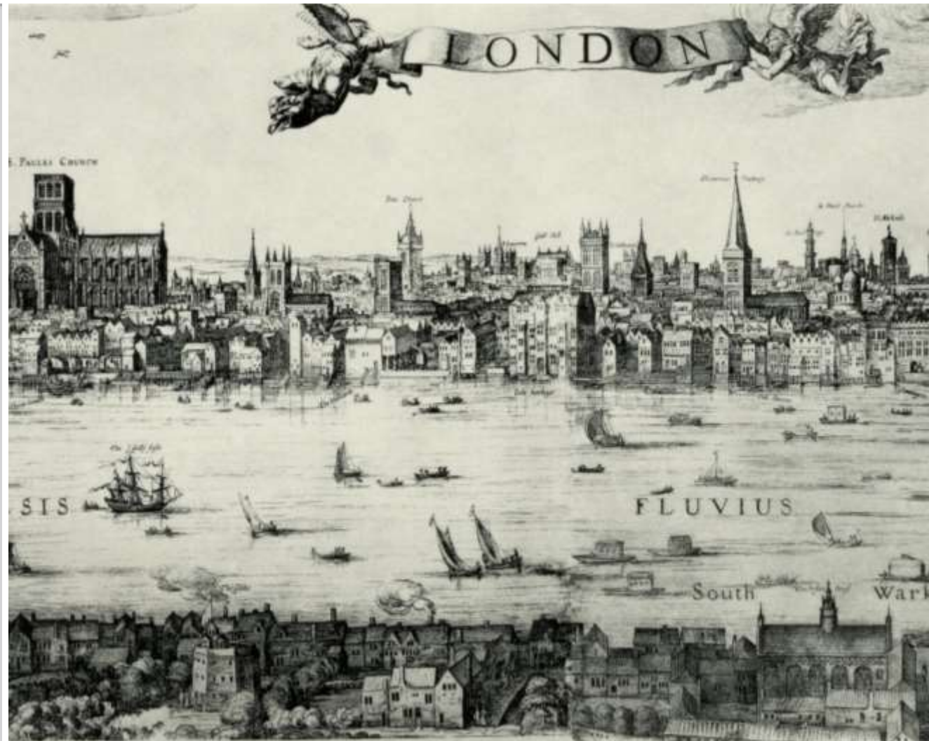
VISSCHER'S VIEW OF LONDON, 1616

London in 1616; it would have looked much like this when John Owen arrived in 1642.