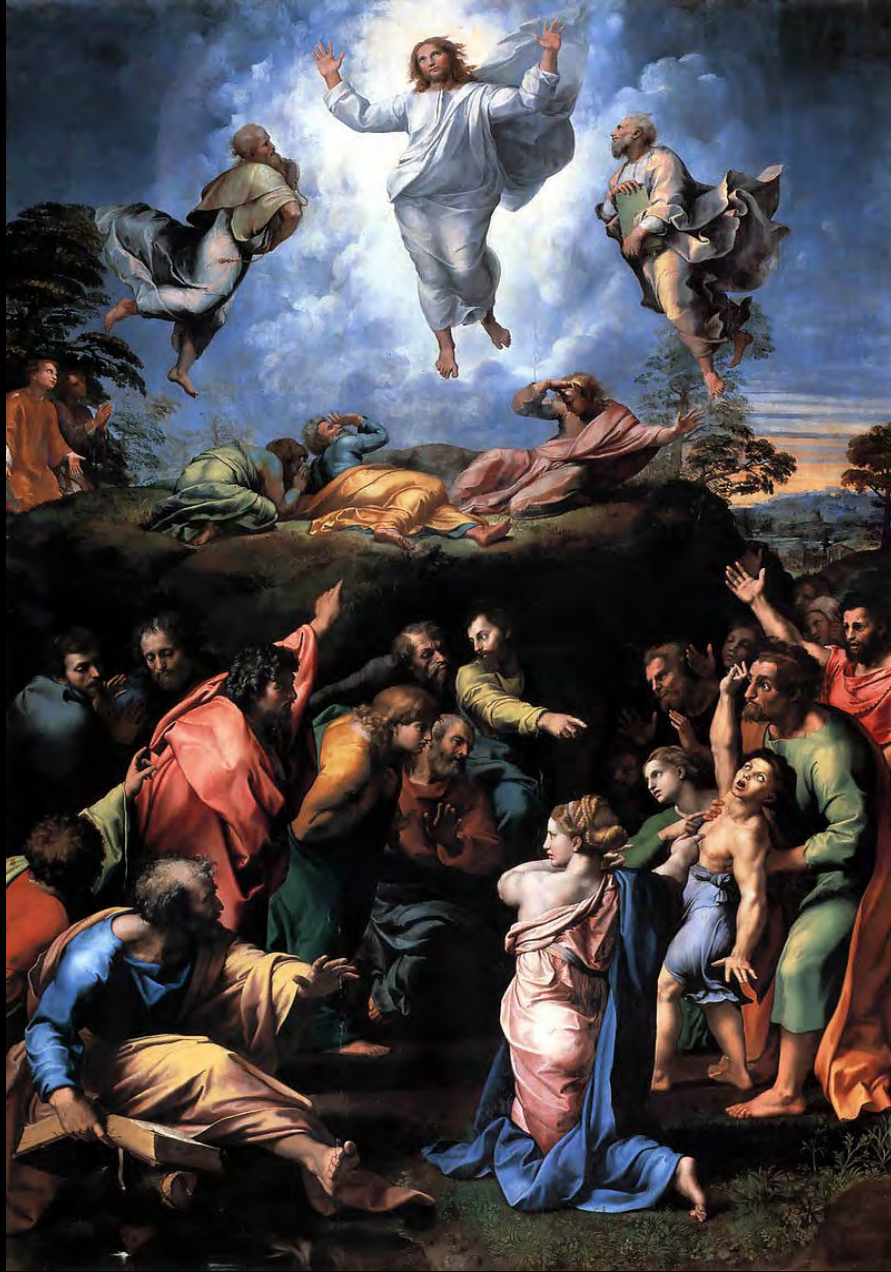
The Transfiguration by Raphael Cir. 1516-1520