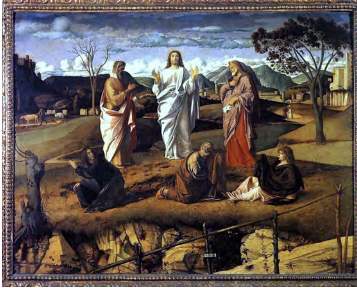
JESUS IS TRANSFIGURED BY GIOVANNI BELLINI CIR. 1490