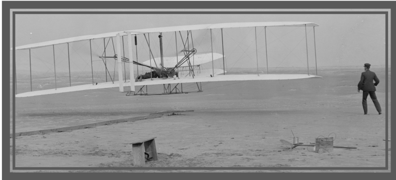
First flight - 1903 (Kitty Hawk, N. Carolina) First passenger flight - 1914 (St. Petersburg, Fla. to Tampa)