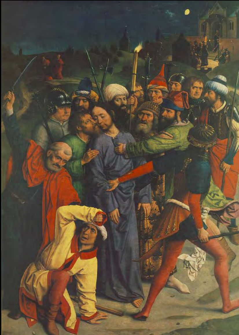
The Arrest of Christ by Dieric Bouts Cir 1485