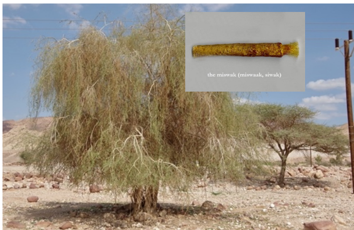
Mustard Tree ( salvadora persica ) with "toothbrush"

the two miracles that precede Jesus' four parables about the kingdom. This plant can also grow quite large, 10-12 feet, and thus serve as places for nests and perches for birds. It has an incredibly tiny seed, one that fits the description. One may not think this could be what is in mind, because the ESV reads, "tree," not "plant." But the word dendron can be translated as shrub or plant or bush or bramble, and I believe should be here. 17