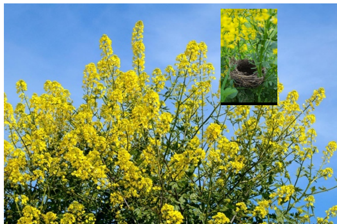
Mustard Plant ( sinapis alba ). Bird nest in branches.

Almost all scholars believe that it is the plant and not the tree that is in mind. But if that's true, then we need to think about the differences between it and the tree . The most important is that the tree, as we have seen, grows up by itself. To get a new one, you must plant another one. The plant,