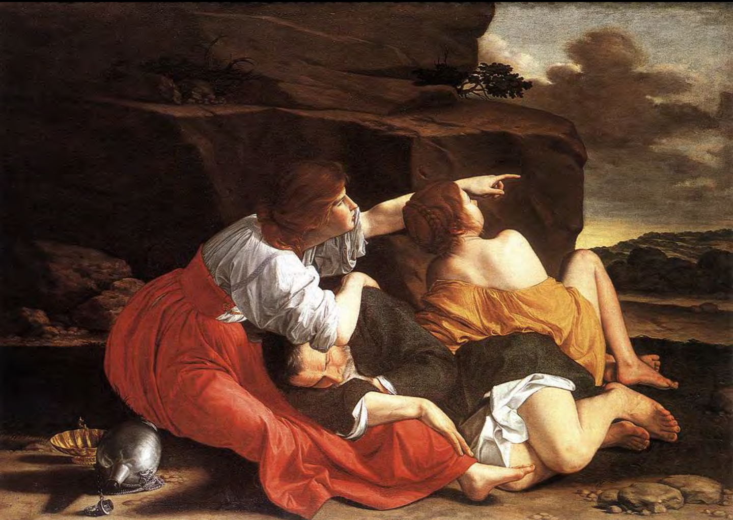
Lot and his Daughters by Orazio Gentileschi, Cir. 1621