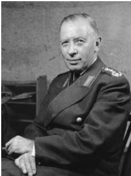
Adolf Heusinger

Also among them was Adolf Heusinger, “ one of the many high-ranking Nazi and fascist officials ” who had been integrated into U.S. military and intelligence networks.” Heusinger had been Hitler’s Chief of the General Staff of the Army, and in 1961-1964 was appointed as Chairman of the NATO Military Committee, so fluid was the transition from being a high-ranking Nazi to becoming a military commander of the “Free World.”