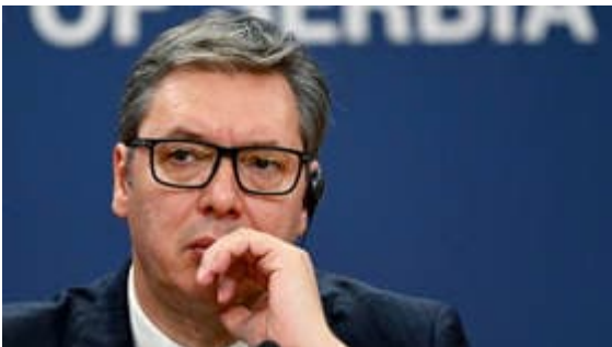
Serbia's President Aleksandar Vucic

https://www.rt.com/news/563203-serbia-global-war-gloom/