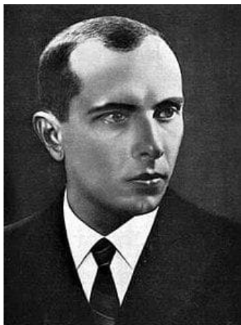
Stepan Bandera

A declassified secret CIA history shows that the Agency refused to extradite the OUN war criminal Bandera to the Soviets in order to keep the underground movement and the destabilization efforts in Ukraine intact.