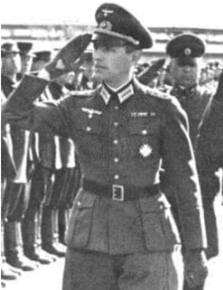
Reinhard Gehlen