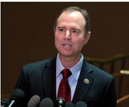
Adam Schiff

Exposure of these realities in the U.S. and UK social media or in books and journals leads to being labeled a Russian “bot” or “Putin’s useful idiot.” Perhaps the most authentic useful idiot is Russiagate Rambo Adam Schiff , Democrat from California and Chairman of the House Permanent Select Committee on Intelligence, who on the occasion of the Trump impeachment hearings in January 2020, said, “We fight Russia over there so we don’t have to fight them here.”