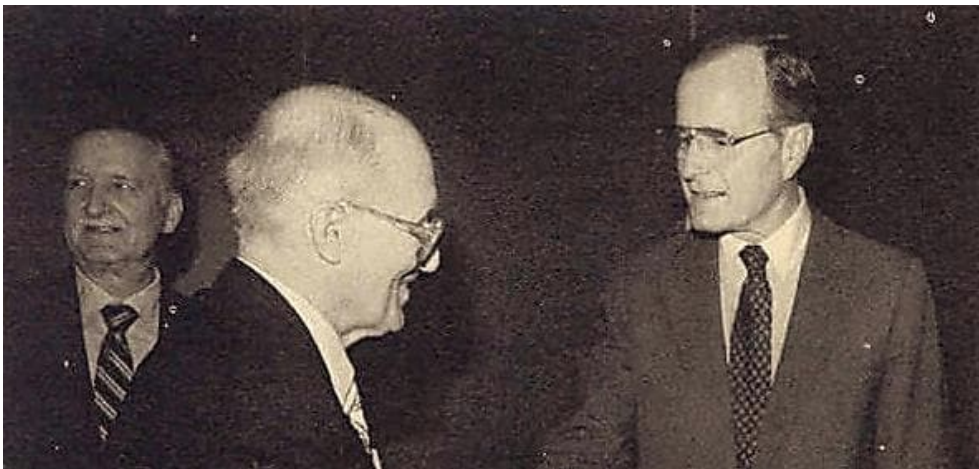
Yaroslav Stetsko with then-Vice President George H.W. Bush.

The OUN, in particular the faction led by the German ally Stepan Bandera and his second in command, Yaroslav Stetsko, OUN-B, was a violently anti-semitic, anti-communist, and anti-Russian organization, which collaborated with the Nazi occupation and actively participated in the slaughter of millions of Poles, Ukrainian Jews, and ethnically Russian and Ukrainian communists in the region. Nonetheless, The Washington Post treated Stetsko as a national hero, a “lonely patriot.”