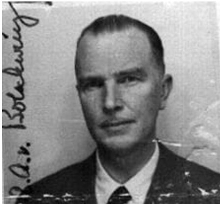
Otto von Bolschwing

In the early Cold War years, there were hundreds if not thousands of Nazis , including such war criminals as SS officer Otto von Bolschwing (a leading organizer of the Final Solution and an adjutant of Adolf Eichmann), brought into the U.S. from Germany, Ukraine, the Balkans, the Baltic states, and Byelorussia.