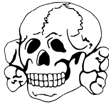
A side-by-side comparison of the R3ICH patch and an enhanced version of the patch worn by Zelensky's bodyguard