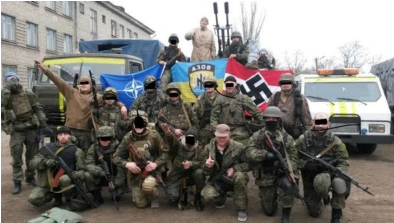
Azov Battalion fighters with NATO flag at left and Nazi flag at right.

Notably, this call for ethnic cleansing does not cite the Germans then occupying Ukraine, yet the fascist and neo-Nazi propagandists who are waging a war in the Donbas region today portray their forebearers as heroes for having defended Ukrainian nationalism from the Soviets and Germany. The Pentagon successfully pressed Congress to lift restrictions on training and providing military assistance to groups, such as the Azov Battalion, that are based on fascist or neo-Nazi ideology.