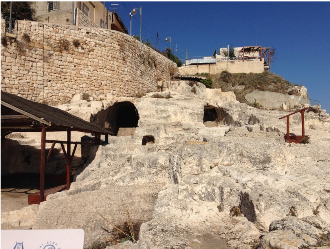
BELOW: Same view but closer to see the Tombs of David. The remains of the Tombs of David after Roman quarrying stones from the tomb.