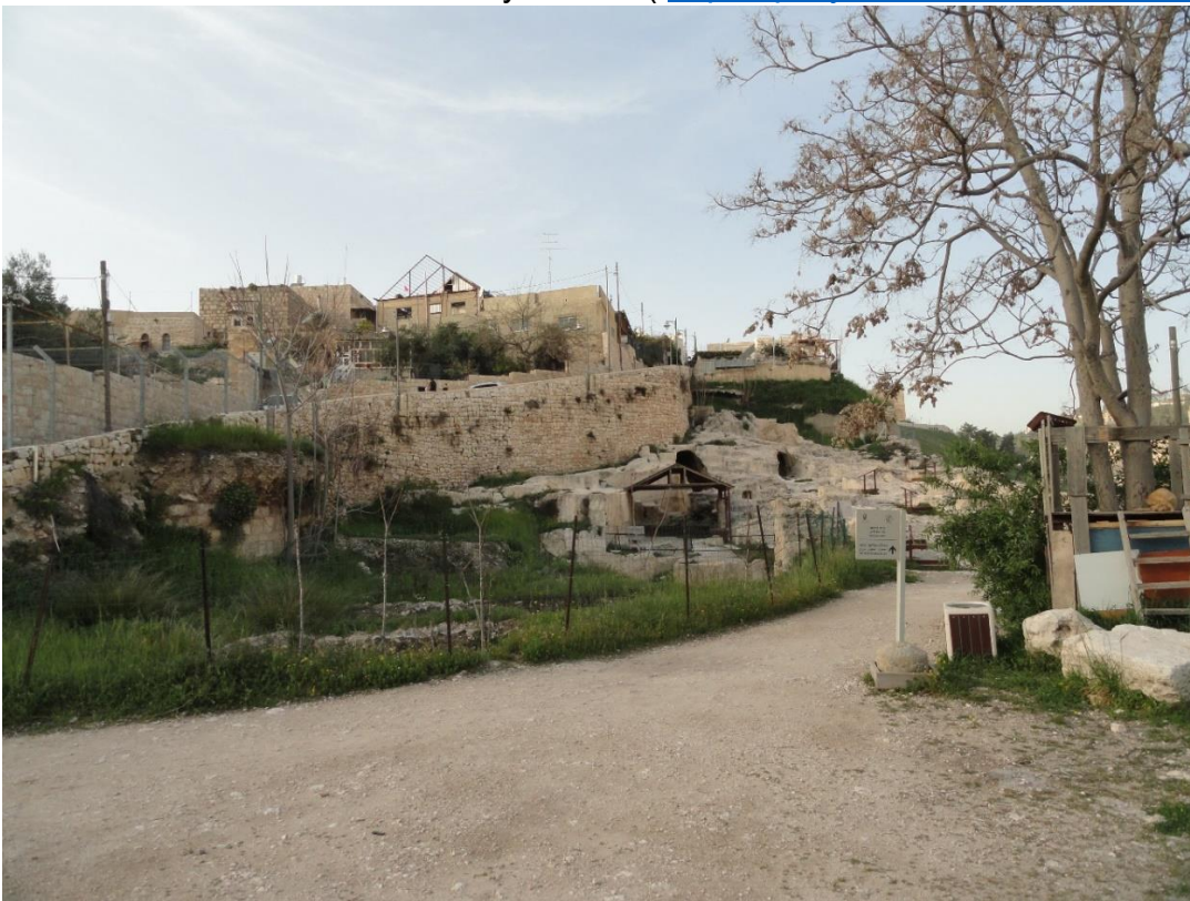
ABOVE: Looking north from outside the Dung Gate in the Hinnom and Kidron Valley intersection. Looking up the Kidron Valley on the east side of Jerusalem.